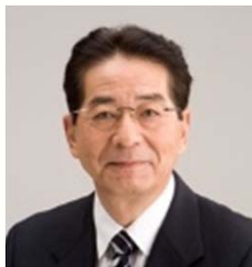
Yoshito Sengoku Visiting Scholar, GRIPS Former Chief Cabinet Secretary

May 13 (Mon), 2013 Part I 13:10-16:10, Part II 16:40-18:10